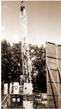
RIG T 53 Cabot Franks 200