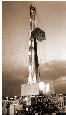
RIG T 12 IRI Franks 900