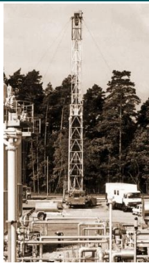
RIG A 52 Cabot Franks 500