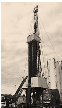
RIG 110 TSM 1200 HP AC